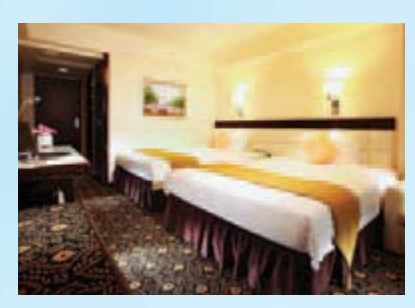
Executive Club Floor Suite

Email: info@oriental.regalhotel.com Website: www.regalhotel.com